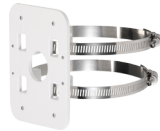
PFA152 Pole mount