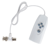
PFM820 UTC Controller