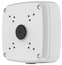
PFA121 Junction box