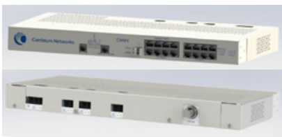
FIGURE 3. The Rack-Mounted Cluster Management Module 4

This CMM includes all of the functionality listed above but there is no switch. This provides the network operator the flexibility to use the switch of their choice with the power and synchronization capabilities of the CMM4.