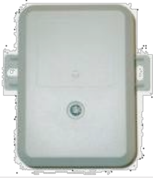
FIGURE 6. Surge Suppressor