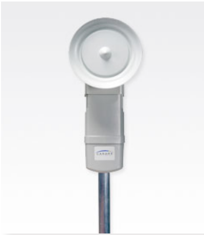
FIGURE 9. The LENS Passive Module