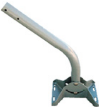
FIGURE 8. The SMMB2 Mounting Bracket