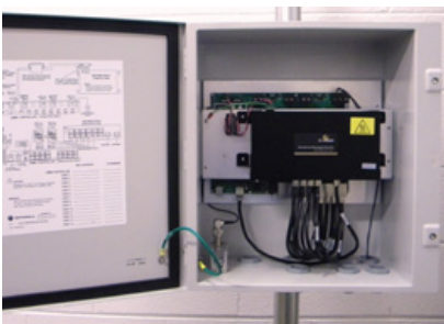
FIGURE 2. The CMM4 Includes 14 Port Ethernet Switch, GPS Antenna and Cables

The Cluster Management Module 3 (CMM3), also known as the CMMmicro, allows network operators to reduce the time and labor cost of system installation and maintenance in AP Clusters. This management module reduces cabling between system modules and provides reliable network synchronization. There is only one cable going from the CMM3 to each module carrying the Ethernet connection, synchronization pulse and GPS data.