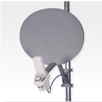
FIGURE 10. The 27RD Passive Reflector