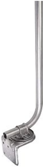
FIGURE 7. The SMMB1 Mounting Bracket

The SMMB2A provides a heavy-duty mounting solution for radio deployments. The SMMB2 is compatible with all Cambium PMP radios, and recommended for all Cambium PMP 400, Cambium PMP 320 Access Points and Cambium PMP 430 Access Points.