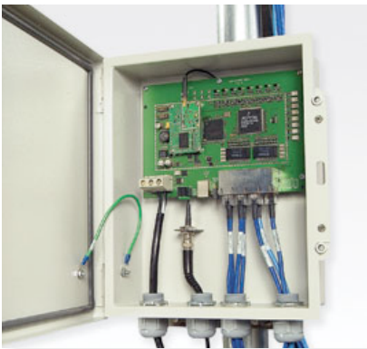
FIGURE 1. The CMM3

Cambium Networks' industry leading wireless broadband expertise helps to substantially reduce the effects of interference for Point-to-Multipoint wireless access and distribution networks in both licensed and unlicensed frequencies. The Access Point (AP) distributes network or Internet services in a sector for as many as 200 subscribers. A variety of accessories are available to work with the APs including the Cluster Management Modules, Universal GPS (UGPS) and power supplies.