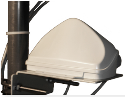
FIGURE 4. The Universal GPS (UGPS)